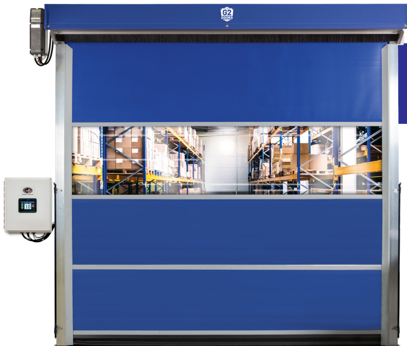
10'x10' door with red, vision, gray, and blue replaceable panels.

Our G2 high performance doors are available with the options you want and the reliability you need for your facility. Whether you are looking for a high speed door fully integrated with your building's safety systems, or simply a reliable door to separate your spaces, G2 doors minimize downtime and maximize profitability in your facility.