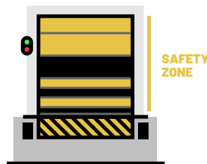
Fall Guard Safety System

While the other guys aim to check the OSHA box, they create additional risk by allowing falls over or through their "barrier." Fall Guard creates a complete safety zone covering the entire opening of your loading dock, ensuring maximum safety while minimizing risk at your facility.