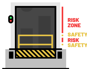
Dock Gate System